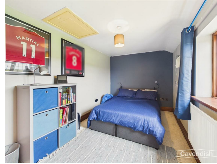
BEDROOM 4 4.19m x 2.44m (13'9" x 8')

Sealed unit double glazed leaded window overlooking the front with views over surrounding farmland, access to loft space, ceiling light point, single radiator with thermostat and built-in wardrobe with hanging rail and shelf.