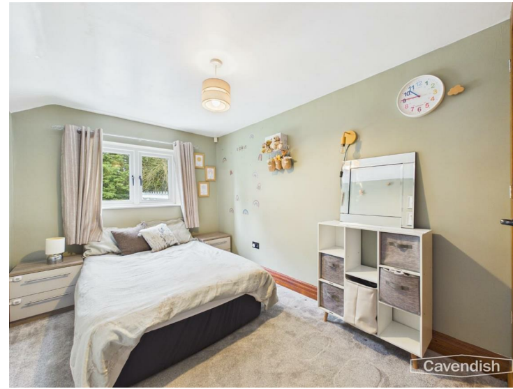
BEDROOM 3 4.09m x 2.44m (13'5" x 8')

uPVC double glazed window to the side, single radiator with thermostat, ceiling light point and built-in wardrobe with hanging rail and shelf.