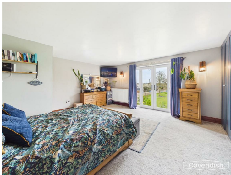
PRINCIPAL BEDROOM 4.67m x 4.88m to front of wardrobes (15'4" x 16' to front of wardrobes)

Fitted with a range of five double wardrobes to length of one wall having hanging space and shelving, uPVC double glazed French doors with full height windows to each side, two wall light points, double radiator with thermostat, and provision for wall mounted flat screen television. Door to En-suite Shower Room.