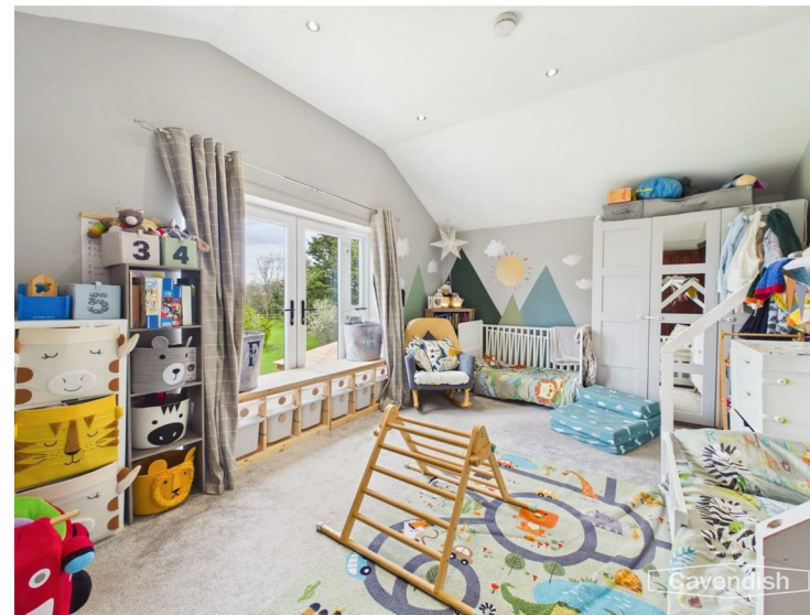
BEDROOM 2 5.08m x 3.66m (16'8" x 12')

uPVC double glazed French doors with double glazed side windows, part-vaulted ceiling with recessed LED ceiling spotlights, mains connected smoke alarm and double radiator with thermostat.